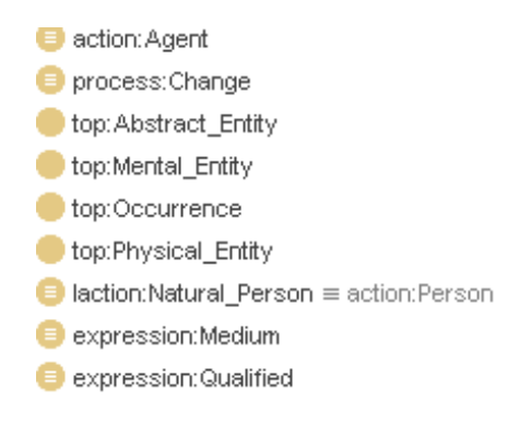
Figure 2. LKIF partial ontology.